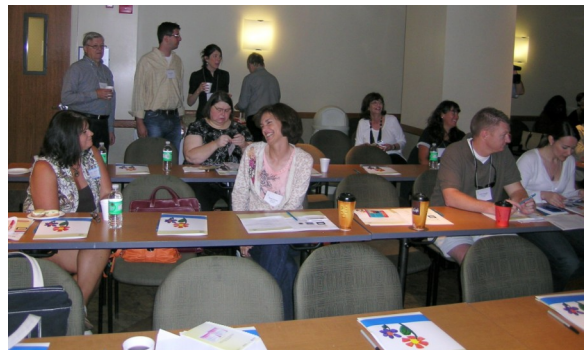
Sharing and networking prior to a session at a previous PA educational conference